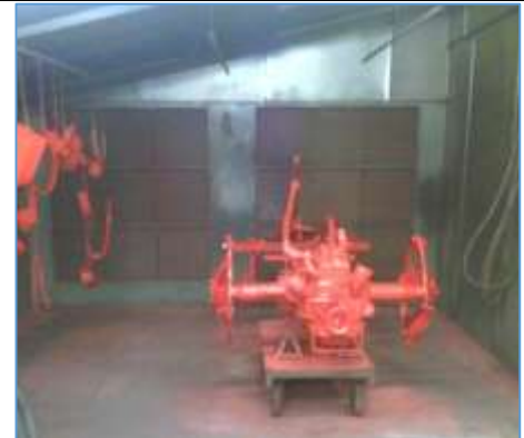
In the paint booth (2).