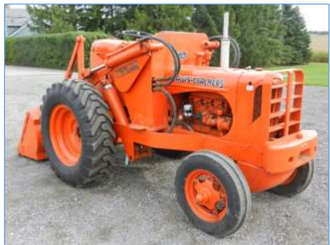
A picture of Calvin Schmidt's TL-W.