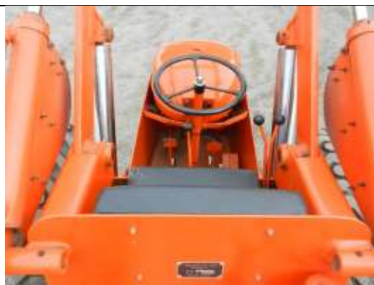
View of operator's seat and controls. Calvin Schmidt's TL-W