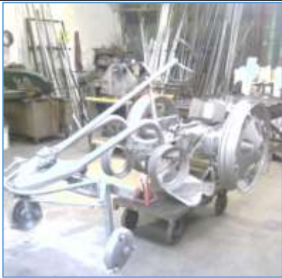
Waiting for paint.