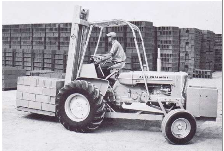
A D15 with a forklift in a concrete plant.

I have personally owned two 715 TLB's since 1977 and will vouch for their bullet proof drive trains. A good friend has a CDS Cummins powered 708E forklift.