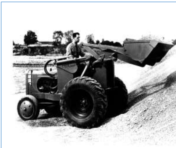
Vintage photo of John Carlson on a TL-W.

Allis-Chalmers records show that there were 80 'B's shipped to TRACTOMOTIVE but their records show 69 converted to TL-B loaders. A-C records show 150 'WF' tractors shipped to TRACTOMOTIVE but again their records show 202 TL-W loaders being produced from early 1948 until 1950. These two loaders were only sold by Allis-Chalmers construction equipment dealers. The manual transmissions soon became the weak point, and new models quickly followed. TRACTOMOTIVE was purchased outright by Allis-Chalmers in 1959 and hence the TL-XX for A-C loader models.