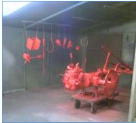
In the paint booth (1).