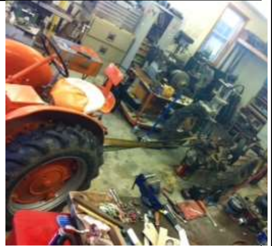
Disassembly in the garage.

The G is an “implement carrier tractor” designed for small farms and vegetable growers. Various plows, planters and cultivators were available to mount on the tractor. The G has a rear mounted AN-62 Continental engine with approximately 10 drawbar hp. (source: Wikipedia & tractordata.com)