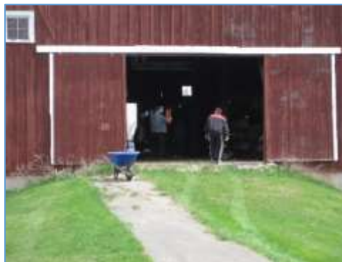
Cleaning the Harrop Barn