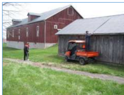
Fixing the Shed Roof