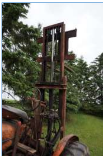
8-10 feet of lift.