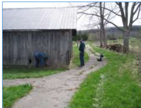
Pulling Vines and Cleaning Up Brush

Lunch was provided with lots of great food and an enjoyable social time, then back to work removing a rear wheel from the A-C grader for repair. Roofing screws were installed in the shed roof to secure some loose sheets of steel, and machinery was moved into the Harrop barn until plans can be made for storage. At 4:30 we were heading home.