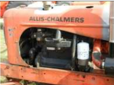
Interesting 433 A-C engine swap into a WD-45.