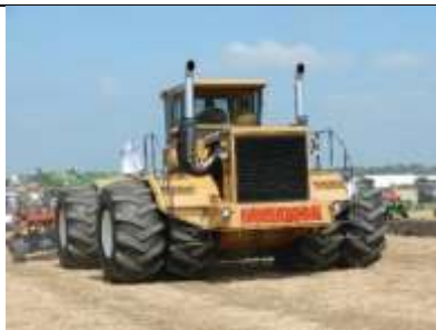
Feature tractor was a Rite-Way 750 powered by a Detroit 12V71 TT that had been tuned up to 850 hp. It plowed with a 15 furrow plow.