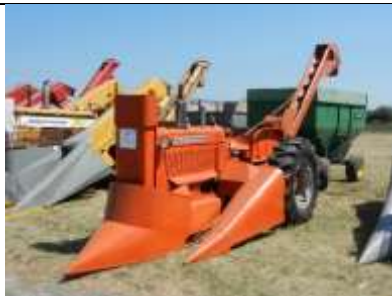
D-17 with mounted picker ready for the field.