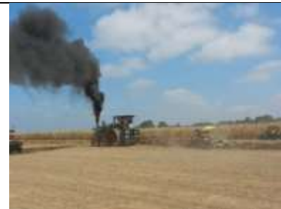
110 HP Case steam engine pulling a modern 10 furrow plow in hard dry ground.