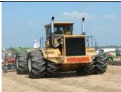
Feature tractor was a Rite-Way 750 powered by a Detroit 12V71 TT that had been tuned up to 850 hp. It plowed with a 15 furrow plow.